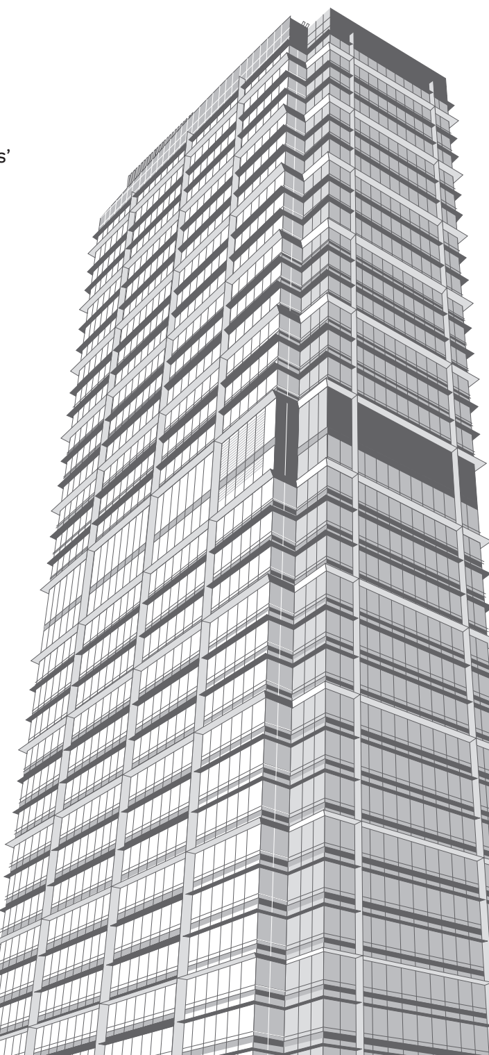
1 QUEEN'S ROAD EAST, HONG KONG

Three-compartment under-floor trunking Card Key system incorporated with the passenger